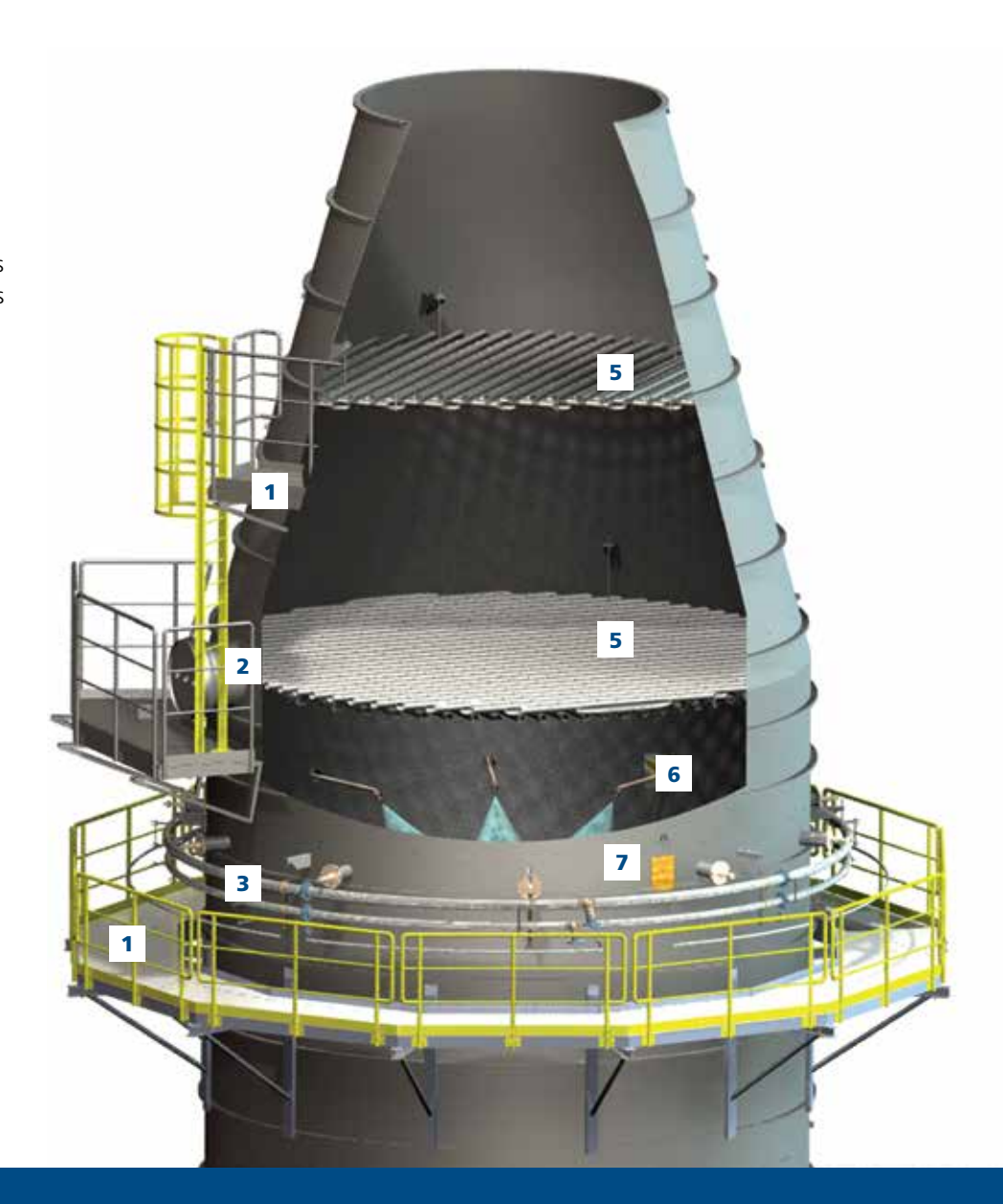
2-phase nozzle with lance, giving a perfect spray.